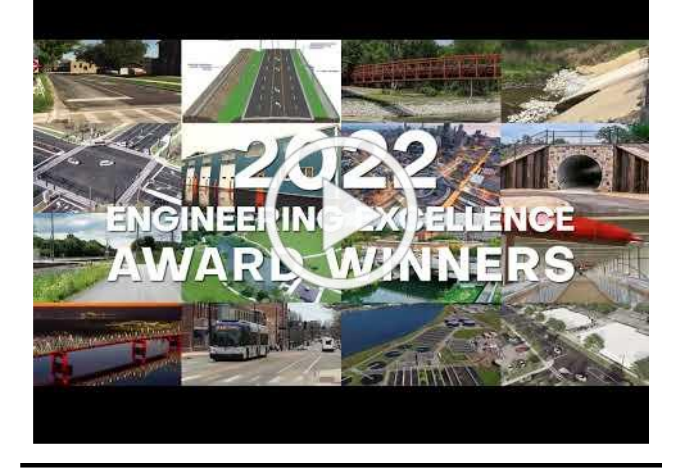
2022 EEA Magazine: Find all award winners below!